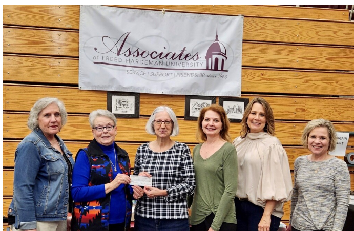
Magnolia Associates gave their first donation check for student scholarships!

The detailed year-end financial statement will be provided at our fall national meeting on September 9.