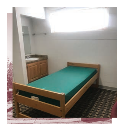
The windows in basement rooms are 70.75" x 22.75". From the bottom of the window to the floor is 65". There are blinds on all the windows in every dorm.