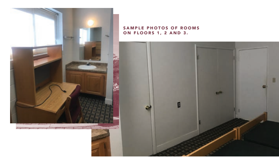
SAMPLE PHOTOS OF BASEMENT ROOMS.