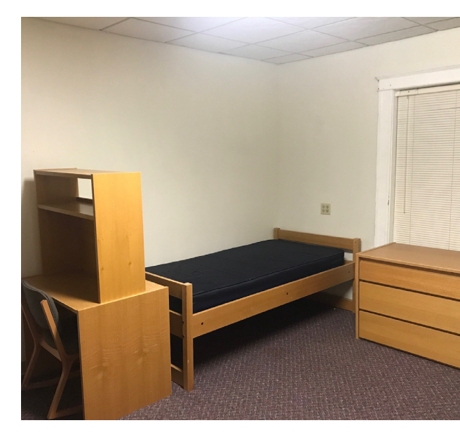
Sample photos of rooms in Hall-Roland Hall.