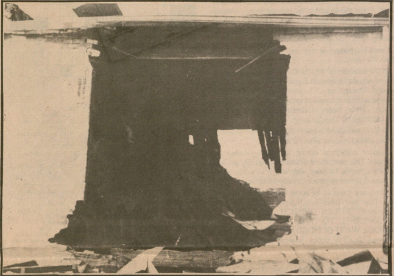
Fire destroyed Henderson Surplus Store last Saturday night in spite of the efforts of firemen from Chester, Hardin, and Madison counties. Their efforts contained the blaze before it