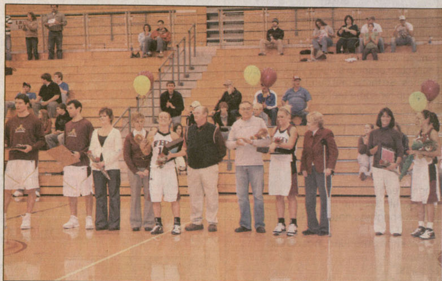
All of the FHU Men and Women seniors as they were recognized during last Saturday's games against Mid-Continent University.

Coming out of halftime, the Lady Lions played inspired ball, once again building up a seven-point lead. Alas, Union responded with a 10-0 run of their own to take control of the game flipped back and forth until the final minute of the