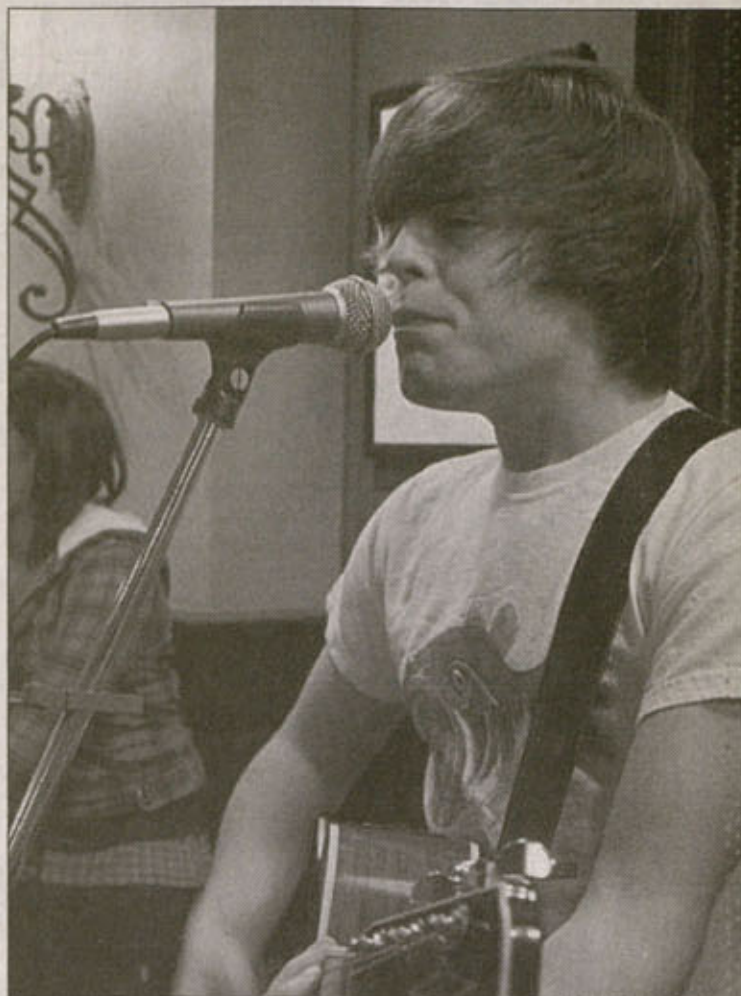
Submitted by Sam Laro

It is quite possible that students will be hearing big things from More than a Movie in years to come.