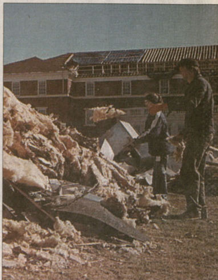
FHU students doing what they can in attempts to clean up Union University after tornadoes hit their school on the night of Feb. 5.