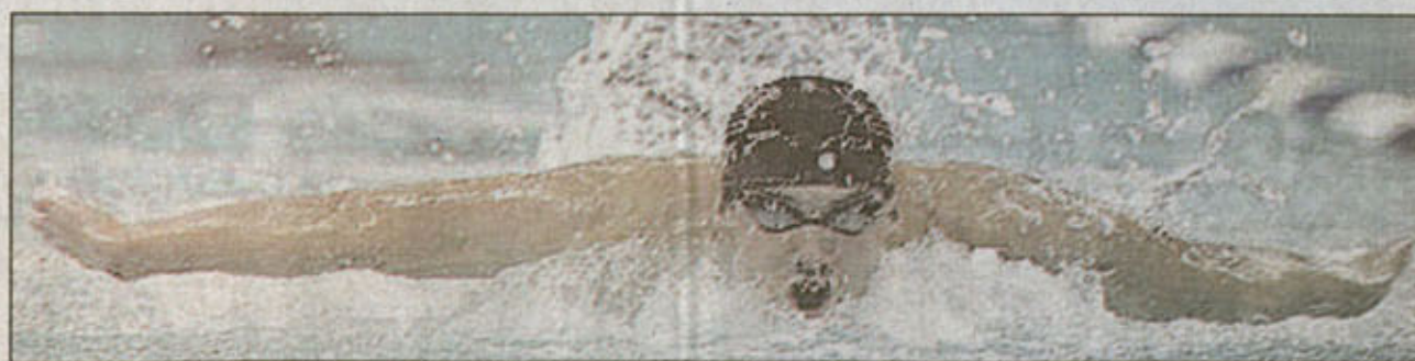
Michael Phelps set a new world record by taking home eight gold medals