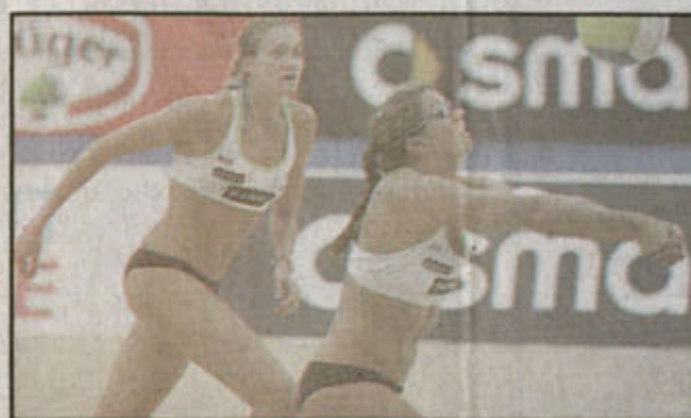
Power team Misty May and Kerri Walsh defeat China for their second consecutive Olympic gold medal.