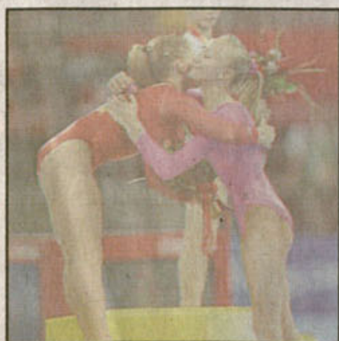
Nastia Liukin and Shawn Johnson took the gold and silver medals, respectively.

The United States came out on top with highest total medals, 110.