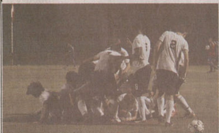
The team piles up in celebration over the 2-1 win.