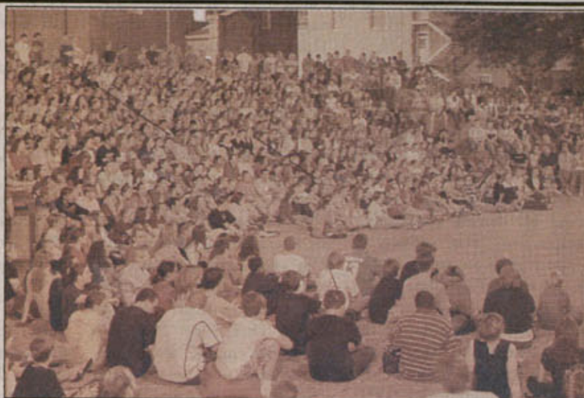
Rush participants gather for a campus wide devotional on Friday night.