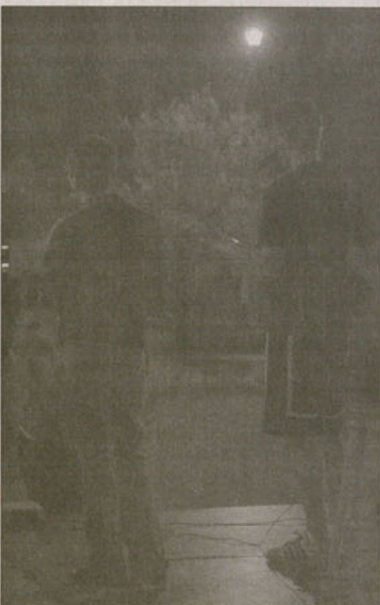
Students bring their "A" game to UPC's Rockband competition