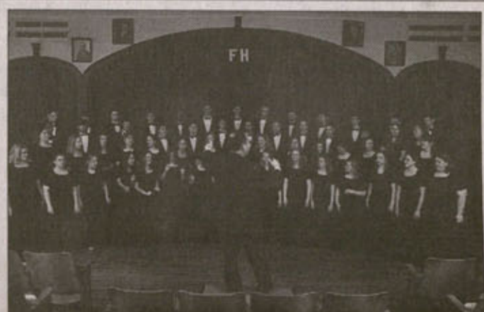
The Chorale performs in Old Chapel Hall.