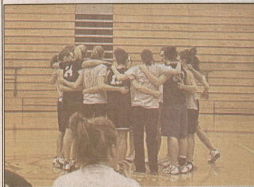
Teams pray together before their intramural basketball match-up

The fast approaching intramural schedule is welcomed excitedly. Those students who were struggling to find ways to spend their time on weeknights now have another option on their list of potential activities. Whether the students are competing on the field, or merely sitting in the stands supporting their friends, they will not be disappointed. They fields are ready. To paraphrase Field of Dreams, "They have built it, now the students will come."