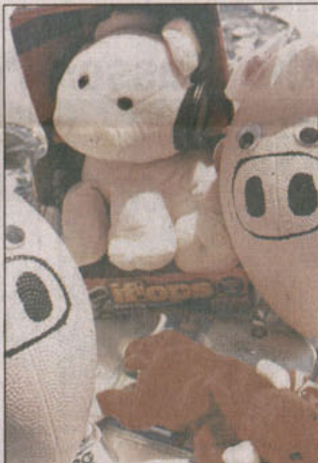
Alana Tucker/ The Bell Tower

Enough with the small talk. What is Pass the Pigs? Oh, you don't know? It is only the most fun, pig-related, pig-shaped dice game you have ever seen. Each player takes turns rolling two small rubber pigs and the way they land determines the number of points each player receives. In the game of blackjack, you keep adding cards to your hand until you reach 21, or until you bust. Much like this game, in Pass the pigs, you keep rolling the pigs as long as you want. Different pig positions earn you points. "Siders" and "Trotters" are commonplace. You have to work for those big points such as a "Snouter" or "Leaning Jowler". Players beware; a "Pig Out" results in the loss of your points in that round. Even more dangerous is an "Oinker". The detestable "Oinker" is where the two