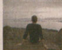
Welcome to Coffee Tasting.

Whether it's a late night research paper, an early morning lab practical, a substitute for an afternoon slumber, a rendezvous with friends, or a date with that certain someone you've been hittin' on at devo, a good cup of coffee always pairs well with the dynamics of college life. It's warm and inviting. It's bold and invigorating. And, yes, it's caffeinated. But there's more to a good cup of java than the jitters you get while trying to avoid sleep and ace your exams. A good brew of coffee is loaded with flavors, aromas, and complexities that will keep your palate begging sip after sip. Fresh almonds and roasted chestnut. Rich, dark cocoa. Tangy, sweet citrus and blackcurrant. Subtle notes of caramel. Earthy spice. With time your nose and mouth will dive into a flavor wonderland with such depth it could take you an entire pot to discover all the subtleties of the roasting process. And because your senses are serious matters, it is important to invest just as much care into what you brew as you would in the moments you brew over it.