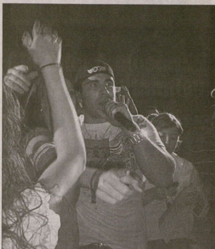
Josh Gracin interacted with the crowd when he performed in Lloyd on September 5th

While this event may have been considered just another concert at any other college campus, Freed-Hardeman was very grateful to have Gracin perform. Hopefully this experience is only a foreshadowing of what great things are to come here at FHU.