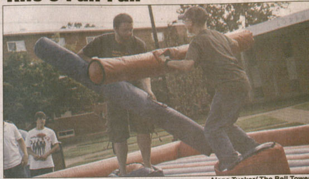
Students took the opportunity to hit one another, all in good fun.