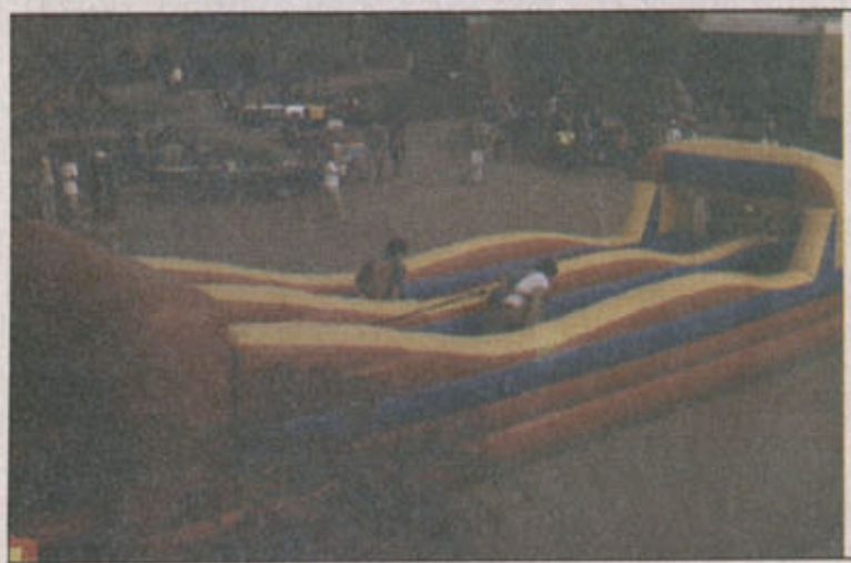
Students and RUSH kids enjoyed the many games at Fun Fair.