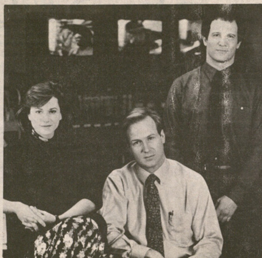
Holly Hunter, William Hurt and Albert Brooks star in "Broadcast News," a romantic comedy about the lives of tv reporters in Washington, D.C.

The supporting cast of Broadcast News includes Lois Chiles as Capitol correspondent Jennifer Mack, Joan Cusack ("Saturday Night Live," Sixteen Candles ) as assistant news director Blair Litton and Robert Prosky ( Outrageous Fortune ) as the