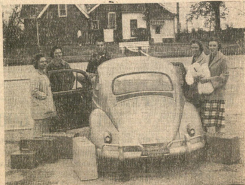
We'll soon be on our way home for the Christmas holidays.

Speaking of lunch lines, won't it be swell to eat some of Mom's good ol' "home-cooking"? Just think, you can simply walk into the dining room and enjoy (Continued on Page Four)