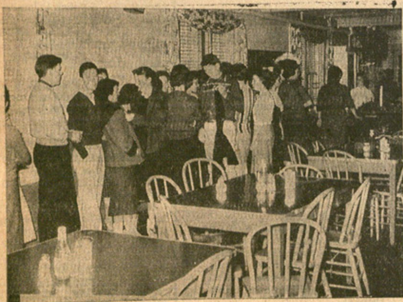
Just think of it students! No standing in line for three whole weeks!