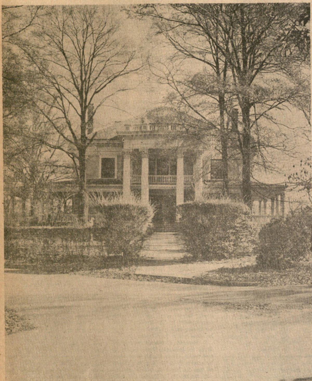
The Clyde Purdy Home